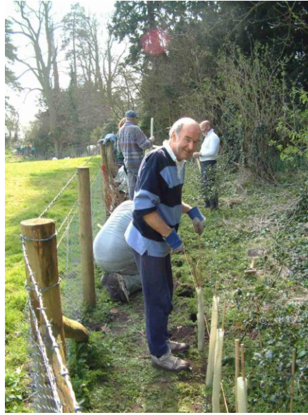
Volunteers planting a hedge