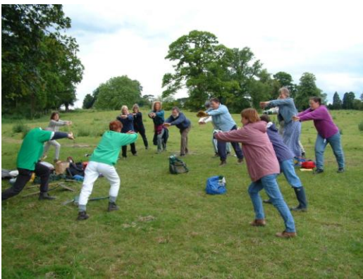
The Wallingford Green Gym