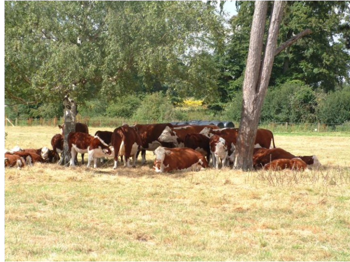
Hereford cattle grazing the meadows