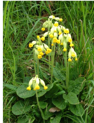
Cowslips – found on the ramparts

The full management plan is available to view on the Earth Trust website at www.earthtrust.org.uk If you have any further enquires relating to the site or its management please contact the Earth Trust on 01865 409972 or email admin@earthtrust.org.uk