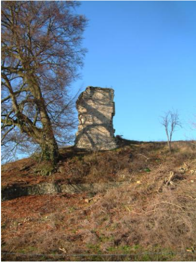
Remains of the castle