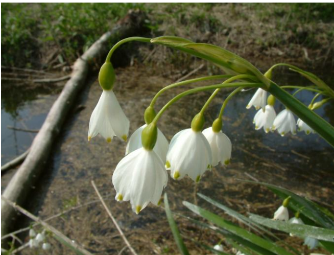
Loddon Lily (summer snowflake) – found along ditch banks